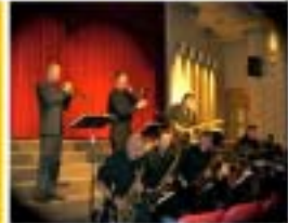
Octagon, Little Big Brass Band

30 Craft Beers for your Tasting Pleasure