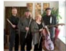
The Reese Project